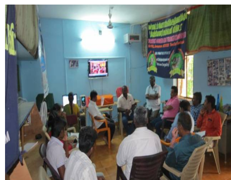
L3F Capacity Building training to NGO Leaders

VIDIYAL is also up scaling the experience and learning of L3F with 15 NGO partners in Theni District. With Different Stakeholders adopting the "WIN – WIN" framework to make learning for sustainable development and focus its efforts on building models. It developed some innovative models using a range of approaches and technologies to bring the sustainable development through L3F which will enhance livelihoods and lead to the empowerment of the farmers. Learning can empower citizens to take greater responsibility for their own well-being and that of their societies and the environment