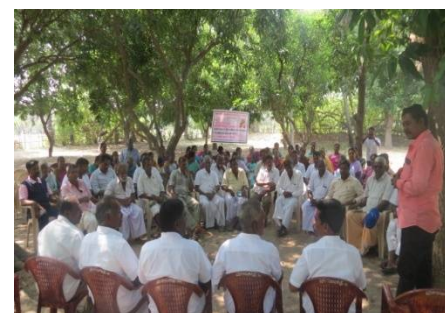
FPC Exposure at Nagapattinam

The movement of Producer Company was initiated with an objective of providing livelihood support and economic benefits to small and marginal, and to encourage their participation in emerging high-value markets with prime focus on exports and the unfolding modern retail sector in India. A Farmers' producer company can be seen as a hybrid