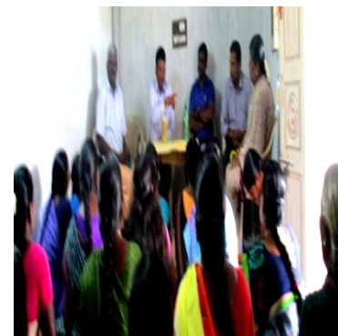
Business Management training

Entrepreneur in this way get an opportunity to lead an independent and honorable life and at the same time they enable others in getting gainful employment. An entrepreneur acts as a catalytic agent for change which results in chain reaction. With the setting up of an enterprise the process of industrialization is set in motion. The success of one entrepreneur sets the right type of example for others to follow. Entrepreneurs, thus, create an environment of enthusiasm and convey a sense of purpose. This gives future impetus to the overall development of that area. This enable them to ensure easy availability of better quality products at lower prices to the consumers which result in the improvement in the standard of living of the people. EDPs provide the necessary support to entrepreneurs by educating them about the latest innovations and market trends.