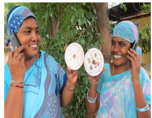
Learning through Mobile Phone