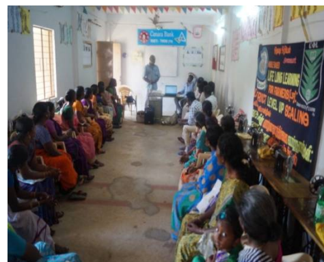
L3F Credit based training to Women SHGs

The ICT based delivery systems has huge potential to promote self directed learning, technology mediated lifelong learning of farmers, such as Voice mails, Web based and Video conferencing, VCD and print based learning methods. ODL for rural farmers creates an opportunity to provide increased and equitable access to update knowledge and necessary skill building. Mobile